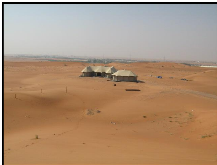
Baobab and Shawu Tent

We have just completed the setup of one Baobab tent and one Shawu tent in the sandy desert midway between Abu Dhabi and Dubai in the UAE. These tents are privately owned by one of the Sheiks. Though the tents are located in a barren desert, the setting as one can see below is quite stunning. The tents were set on a concrete plinth for stability but they will surely have to work constantly to keep the moving sand at bay. It will be sometime before they are fully furnished, landscaped and the swimming pool completed – we will hopefully share these pictures with you all in the near future.