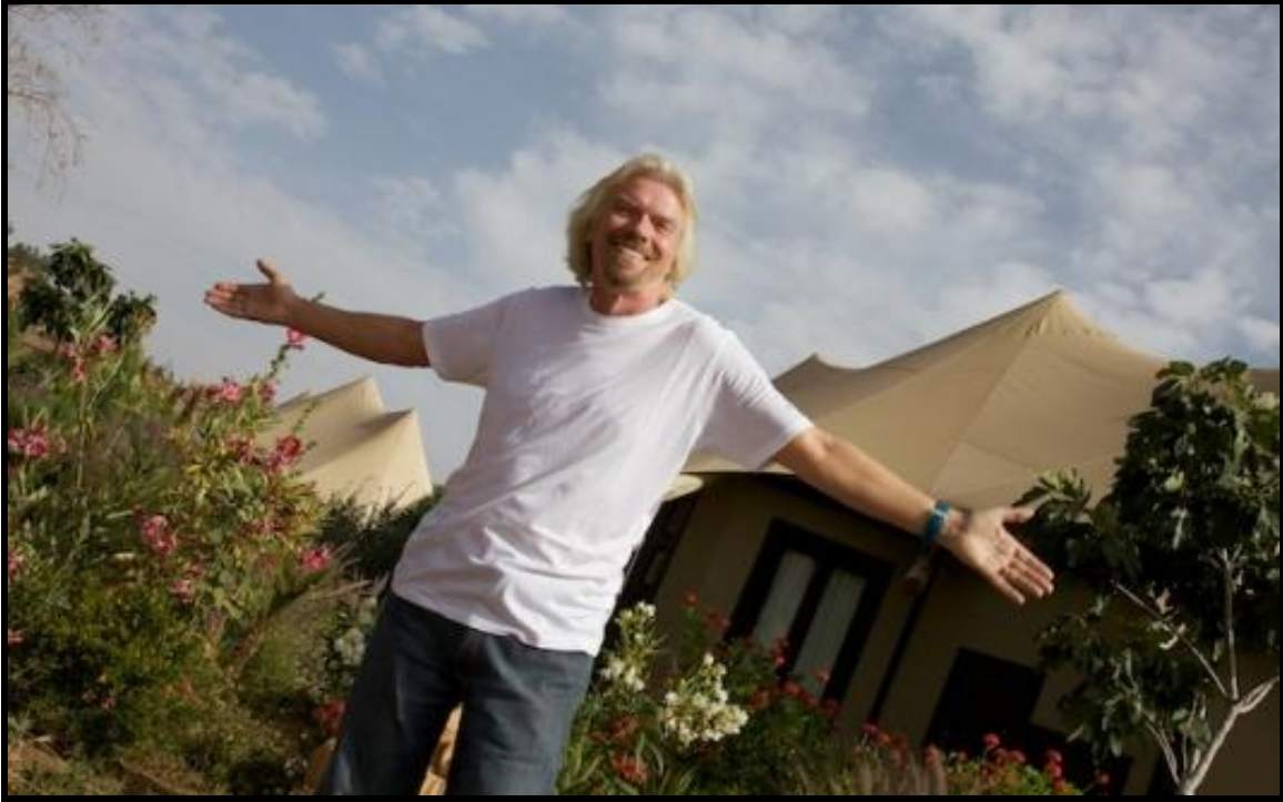
Richard Branson enjoying his tents

Please note the factory will be closing on December 15 th for 4 weeks for the year-end holidays so any orders received after October 15 th may not make it out of the factory before the closing date and will only get completed once the factory reopens. We will however still be taking orders that will go into production in the order received once the factory reopens.