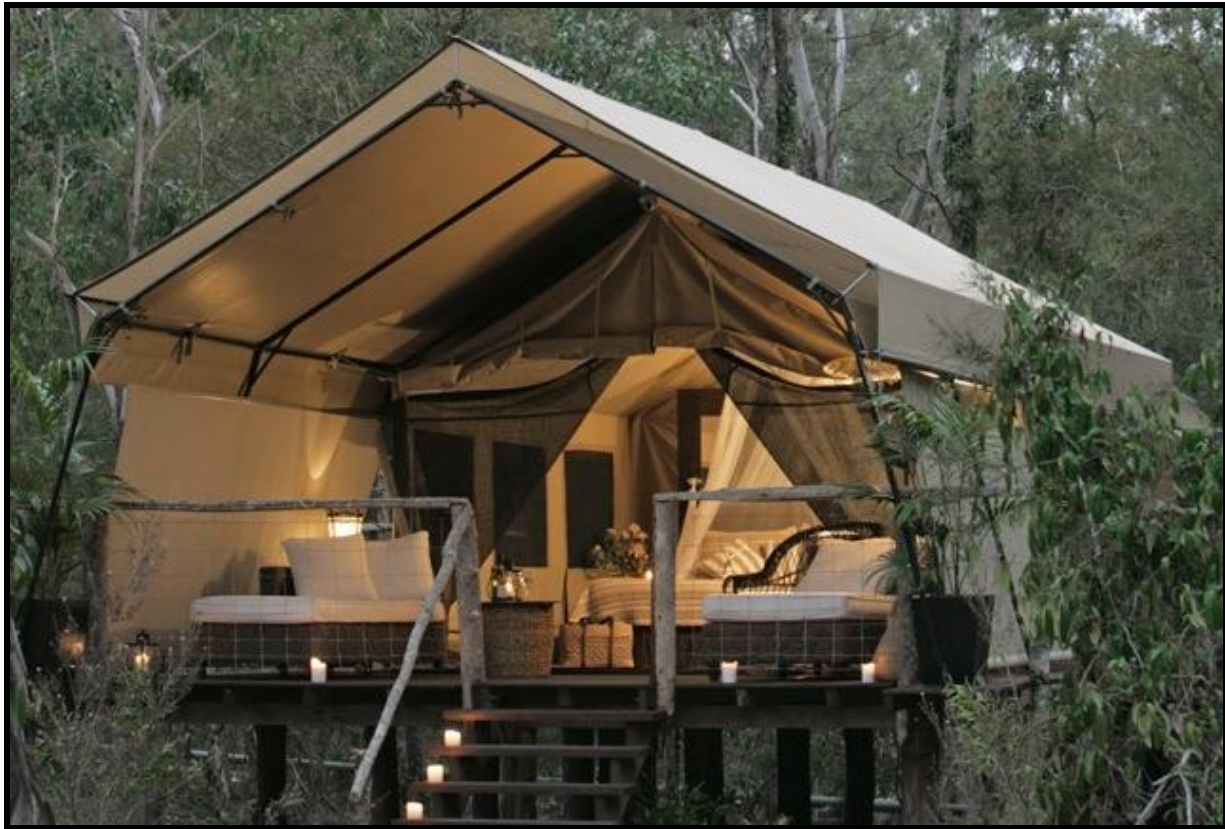
The Serengeti Tent

We have a few firsts in locations with a tent arriving shortly in Nouméa in New Caledonia, another on its way to Kunming in China and coming up soon is one tent near Mt Gilboa in Israel and another going to Taiwan.